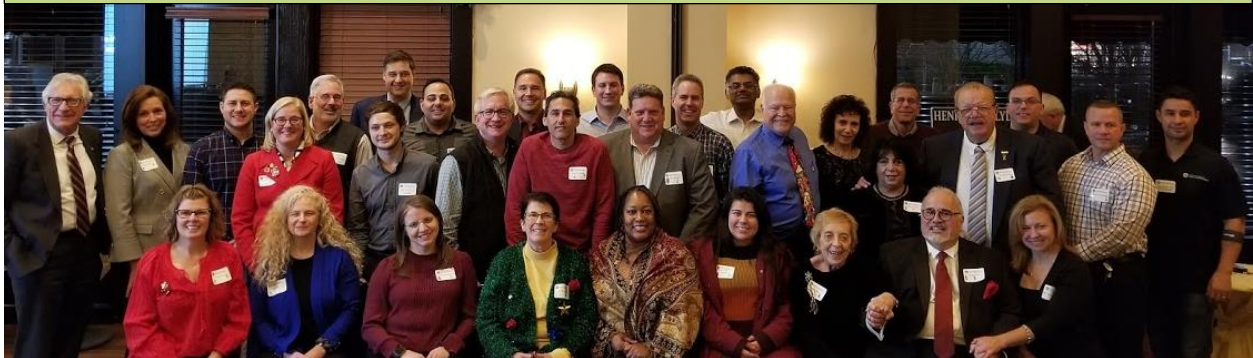
Thanks for coming! See you next year!