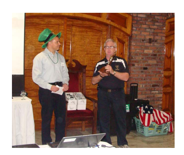
Joint meeting with NJ AIHA and MABSA